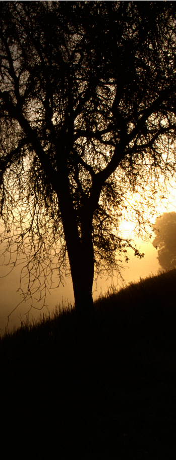
Fall comes to the Delta